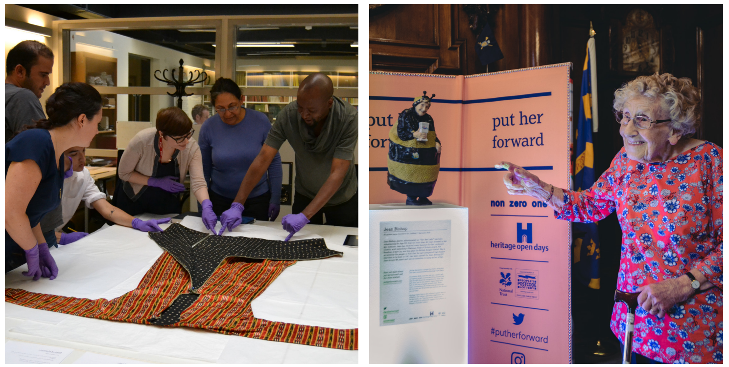
Multaka-Oxford volunteers at Pitt Rivers Museum